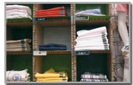
Shelves for shops