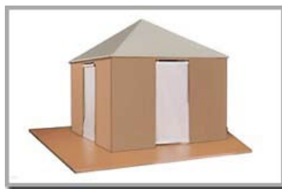
Shigeru Ban house