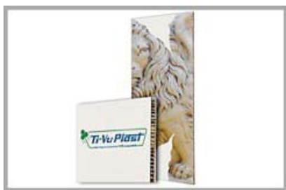
Printable graphic panel