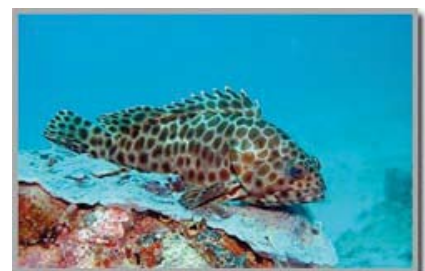
"Honeycomb" fish printed on NIDOPAN®